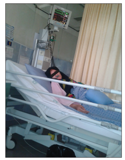
Figure 1: Recording the signal in 45°

Also, among of the various groups, the pain variables, ambient temperature, percent of blood oxygen saturation, blood pressure, respiratory rate, and heart rate were evaluated. Table 2 shows the mean and standard deviation of the variables in five angles of the bed. By changing the angle of the bed, the mean pain, heart rate, systolic blood pressure, and respiratory rate changed significantly (P < 0.05) but the temperature variation, blood oxygen saturation, and diastolic blood pressure in subjects were not significant (P > 0.05). Figure 1 shows the recording of signal for a subject in 45° angle. Figure 2 shows the relationship between pain, heart rate, systolic blood pressure, and respiratory rate with the angle of the bed. The relationship between the variables and angle changed nonlinearly. A significant reduction was observed in pain, respiratory rate, heart rate, and